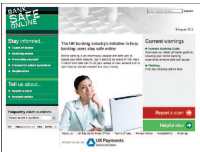
Bank Safe Online web page