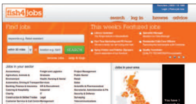
fish4jobs web page