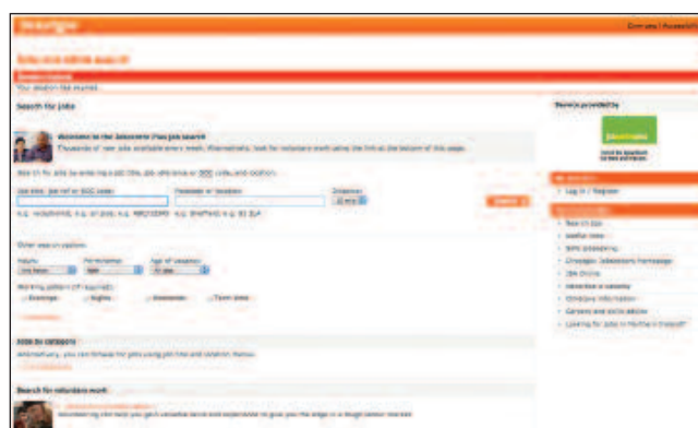
Directgov web page: jobs and skills