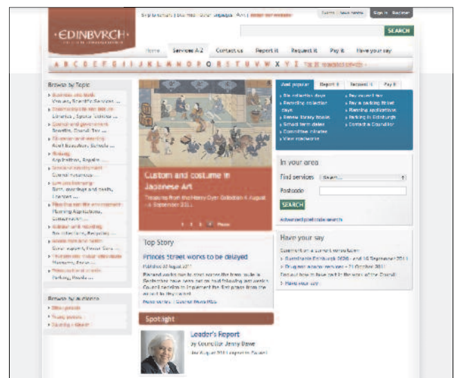
Example of local council web page: Edinburgh Council