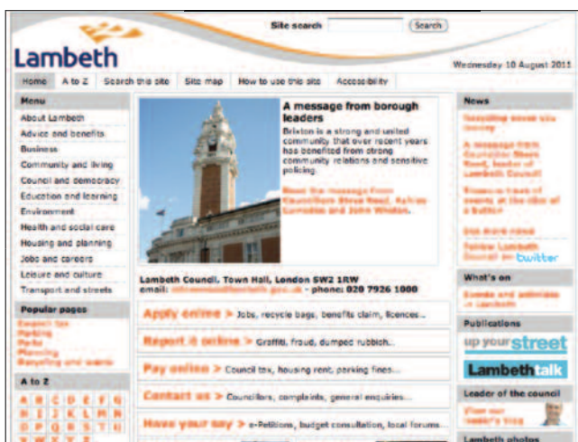
Example of local council web page: Lambeth Council