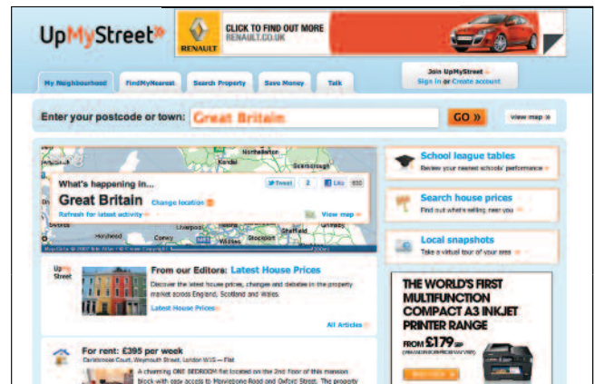
Up My Street home page

How do I find information about my local area?